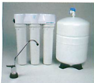
Your authorized Charger Water Treatment Dealer has systems for quality drinking water, too.