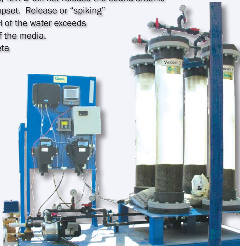
NXT-2 Pilot Unit (Up to 20 gpm)

NXT-2 has a high zeta point pH of 12.0 while many iron based medias have a zeta point of 7.8 pH. This stability reduces the potential to distribute water which has high arsenic concentrations in excess of the EPA standard, due to loss of pH control.